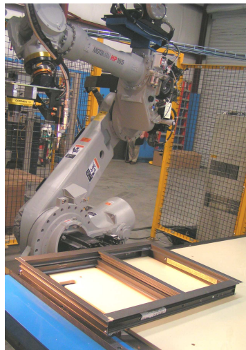
Part Location and Size for Dispensing Two Camera Cognex Vision