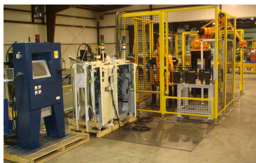
Part Location for Determining Dispensing Path Dispensing Cell, Cognex Vision