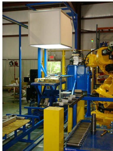
Part Location for Picking Machine Load/Unload Cell, Cognex Vision