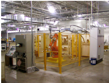
2k Underhood Parts ABB IRB2400