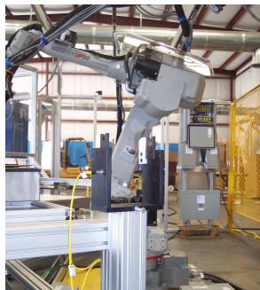
Hot Melt with Foaming