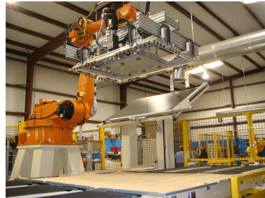
Hot Melt Gluing System Nachi ST200