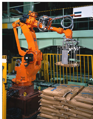
Palletizing Bags Nachi SC50