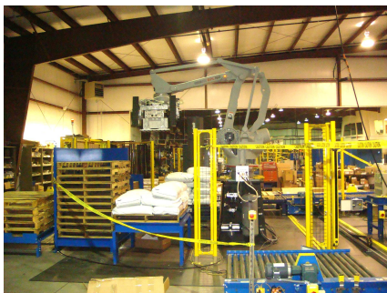
Palletizing FFS Bags Motoman EPL160

Robotic systems, end-of-arm tools, engineered conveyor systems, weigh scales, stretch wrappers, bar coding, data collection, pallet racks, pallet dispensers, slip sheet racks, AGVs and transfer cars