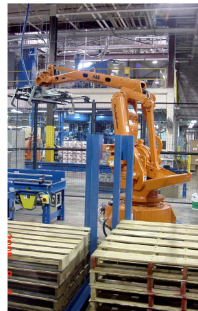
Palletizing Cases and Cartons ABB IRB640